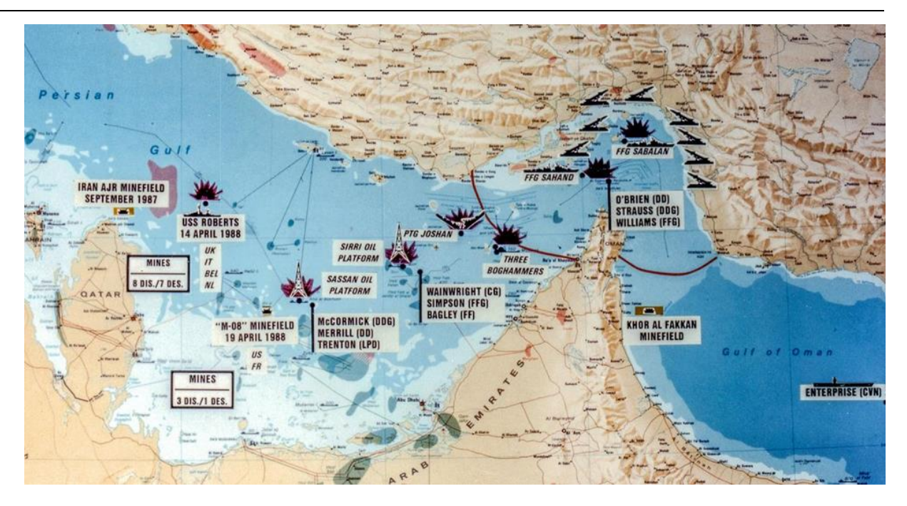
Figure 2; map showing (i) location of USS Samuel B. Roberts' mine strike; (ii) the Sassan Oilfield.<sup>15</sup>

Subsequently, Iran and the US both consented to their respective claims' and counterclaims' being brought to the International Court of Justice. With attribution clearly clarified, the Court found sufficient fact-base evidence that the scale and gravity, planning and intended targeting by the US amounted to its breaching Charter Art 2(4), i.e., an unlawful use of force.<sup>16</sup>