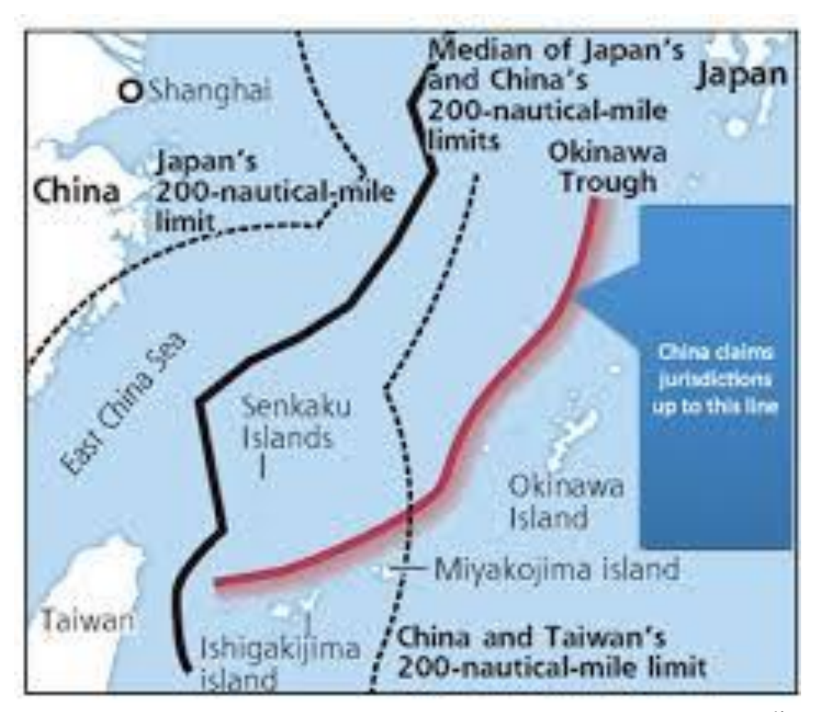
Fig 2; Okinawa Trough, Okinawa-Taiwan, disputed islands, contentious maritime boundaries<sup>10</sup>

Islands. They are known otherwise as the Pinnacle Islands. These claims are further complicated by China's claim that the western margin of the Okinawa Trough demarcates the eastern limit of its continental shelf, a claim contended by Japan. Arguably, the Quad's conducting joint naval exercises in these waters signaled political willingness of all Quad Member States to deploy threat or use of force resistance to China's force-based measures to assert its claims, should it occur.