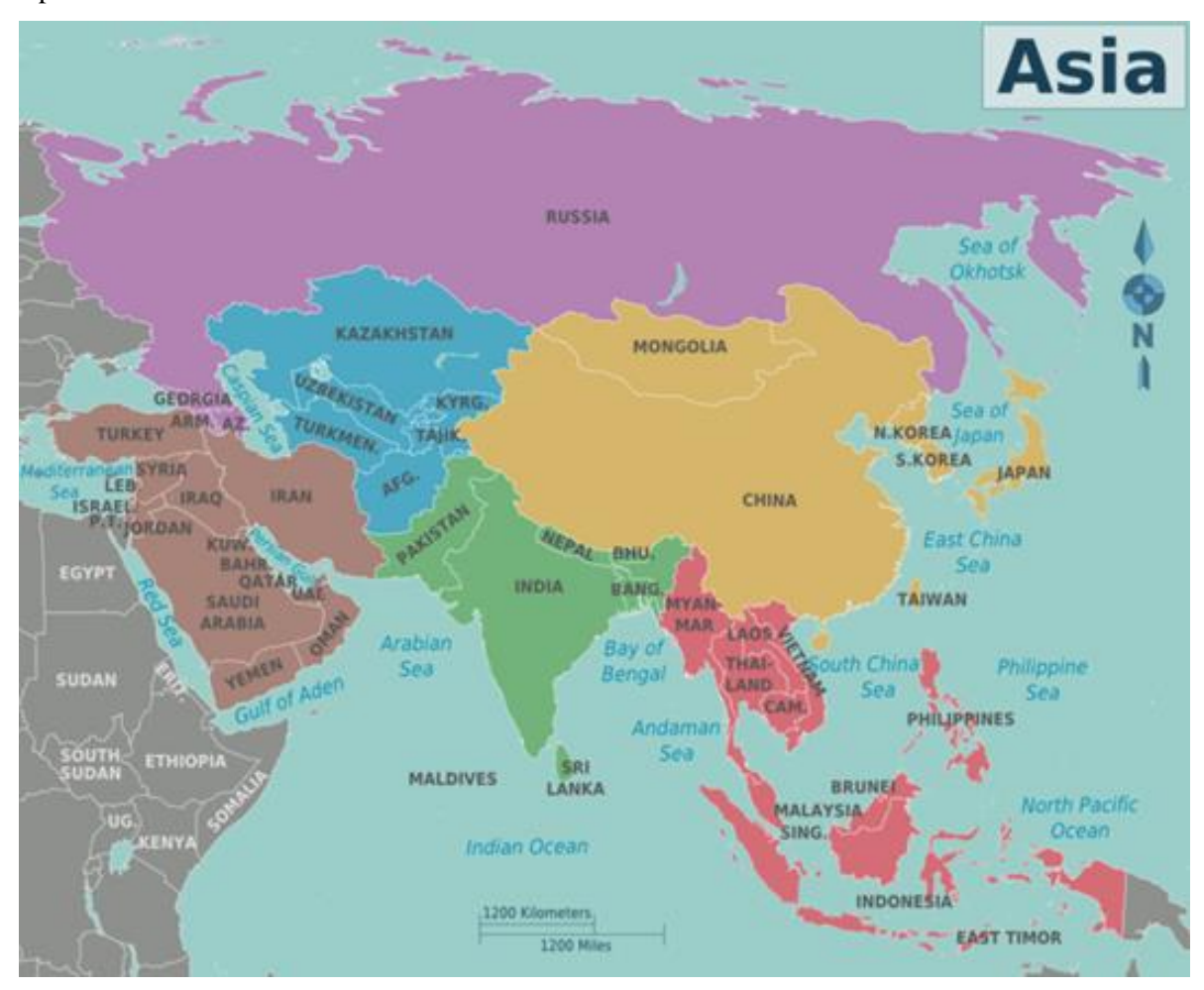
Fig 1; combined breadth of Malabar 07-01 and Malabar 07-02, from Bay of Bengal to East china sea

Notwithstanding real or perceived ambiguity in these varied responses, the Quad 1.0 initiative preceded security-centric diplomacy in the form of a two-part version of the annual Malabar naval exercise. Malabar 07-01 exercised navies of the four Member States plus that of Singapore in the Bay of Bengal east of India. Malabar 07-02 exercised, for the first time, the navies of the US and Japan in the locale of Okinawa.