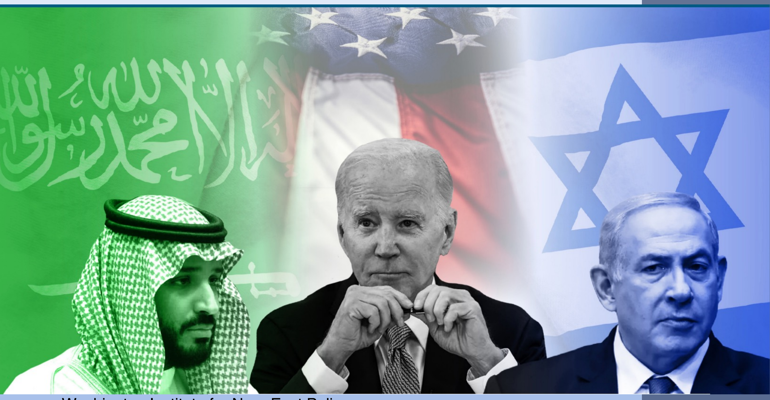
Washington Institute for Near East Policy