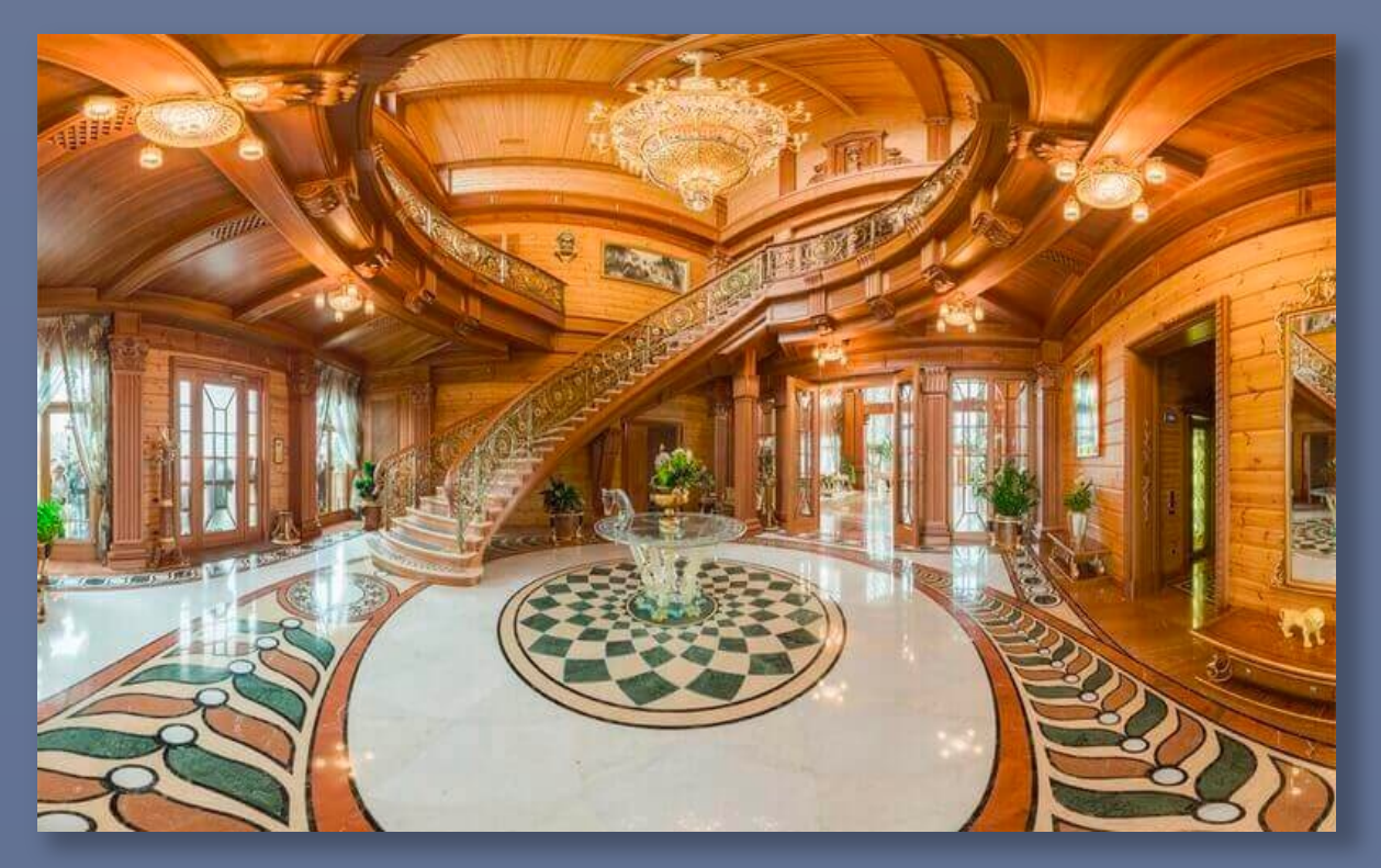
Yanukovych's palace, ca. 2014