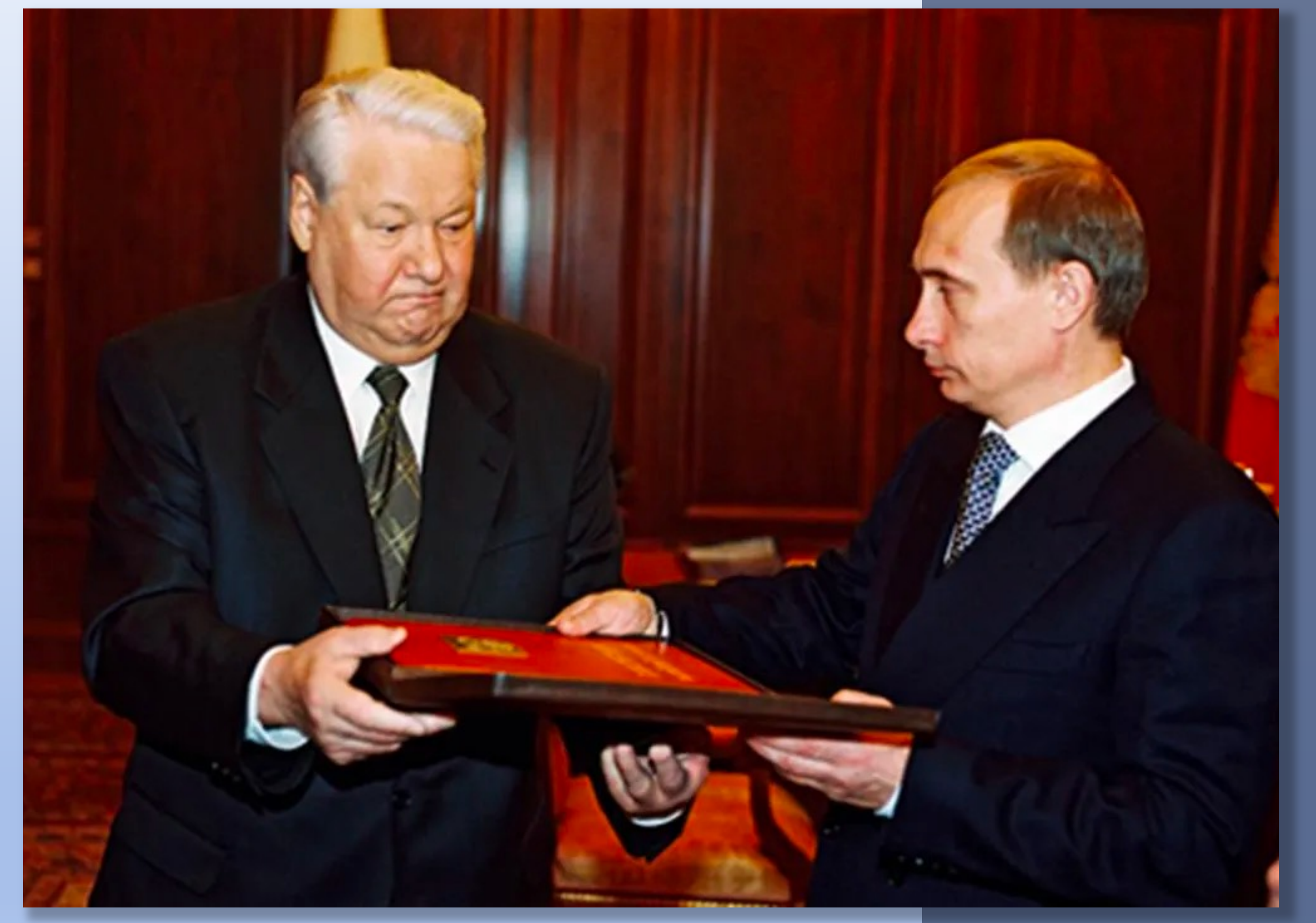
Change of Command, 1999