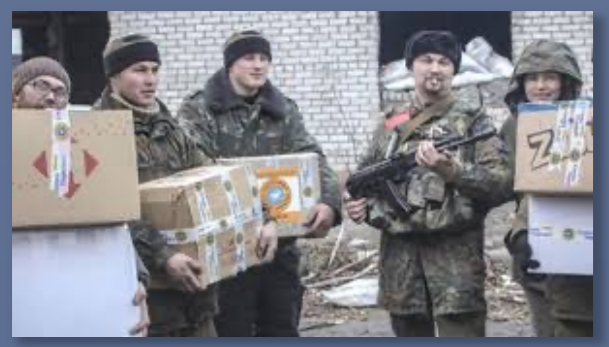
Ukrainian army ca. 2014